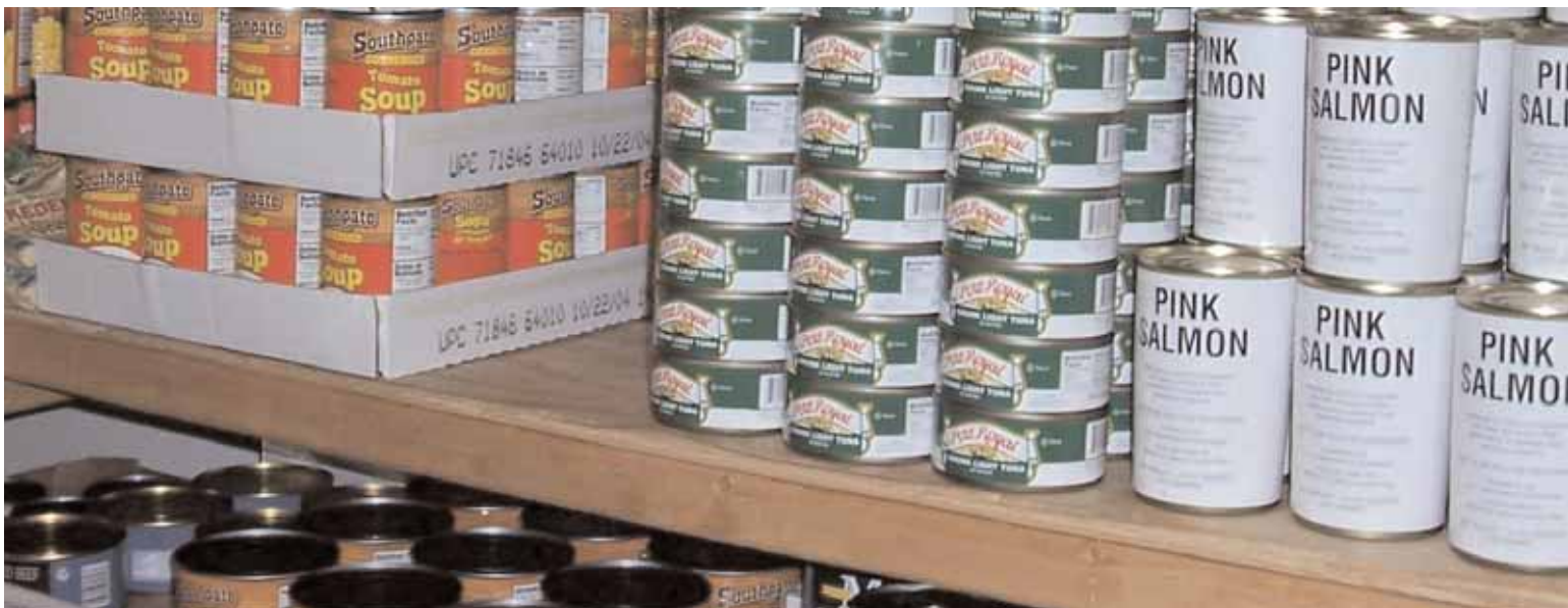
Vivan's Cupboard, Mazzoni's region HIV food bank, last year delivered nearly 10,000 bags of groceries to our clients and their families.

Housing Mazzoni Center currently manages housing subsidies for 64 households in Philadelphia, two more than the previous year. The resource manual created by our staff has been highly praised by the city's Office of Housing and Community Development, and is now the gold standard for other housing subsidy programs in the city. Yet another example of how we raise the bar for those living with HIV and AIDS in Philadelphia.