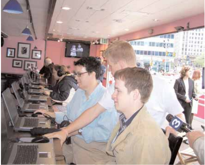
Mazzoni Center partnered with one of our program funders, Susan G. Komen for the Cure, to bring this breast health awareness initiative to Philadelphia.