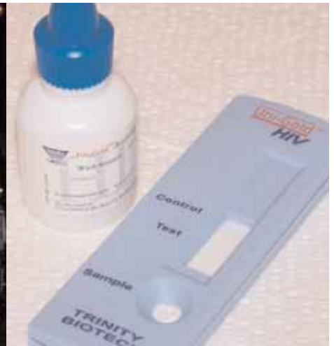
Left photo: Our Mobile Testing Unit is one way Prevention Services raises the bar, by reaching out into neighborhoods where many at-risk communities of color reside...